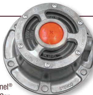
Sentinel® Hub Cap

STEMCO's extensive line of hub caps provide application specific technology designed to eliminate contaminants and extend wheel end life.